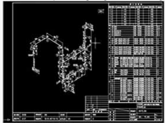
PDSOFT-Pipe Designing and Drawing